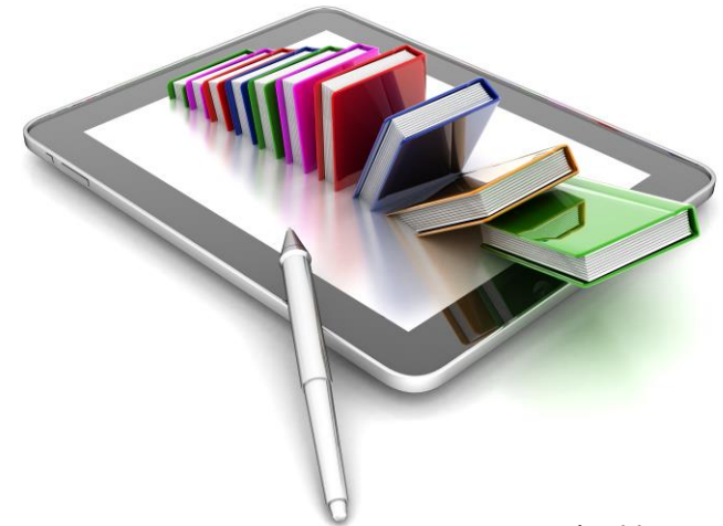
Image guidelines: Where possible, clean and clear images should be used and placed to the right of the text. Align the caption to line up with the header and footer text.